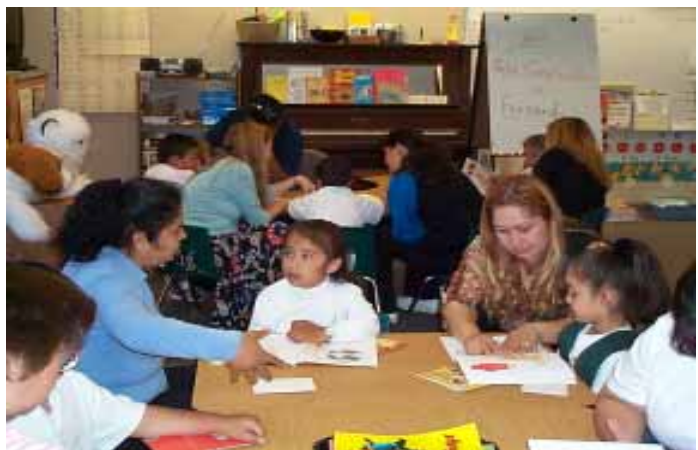
Adult Ed. CBET Class Working in Kindergraten

Parent and Child Together time (PACT) to facilitate parents' interaction with their children as their child's first teacher.